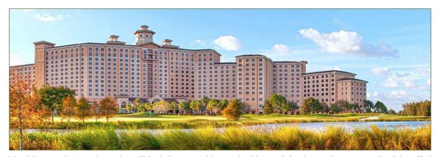
The SCDA 36th Annual Meeting will include new and innovative ideas to bring instruction to a new level, by offering 'Hands-on" Experiential Training opportunities during our Annual Meeting and Expo. Ideally, these would be in partnership with Exhibitors and members who would jointly educate and demonstrate the use of the products, services, and techniques. The settings for these educational experiences could vary from within expanded exhibitor space in the Exhibit Hall or as part of a general or concurrent sessions at the Meeting.